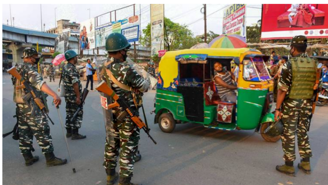
Agartala: Police personnel stop commuters after the state government enforced lockdown in the city amid coronavirus pandemic, in Agartala, Tuesday, March 24, 2020. (PTI24-03-2020_000282B)