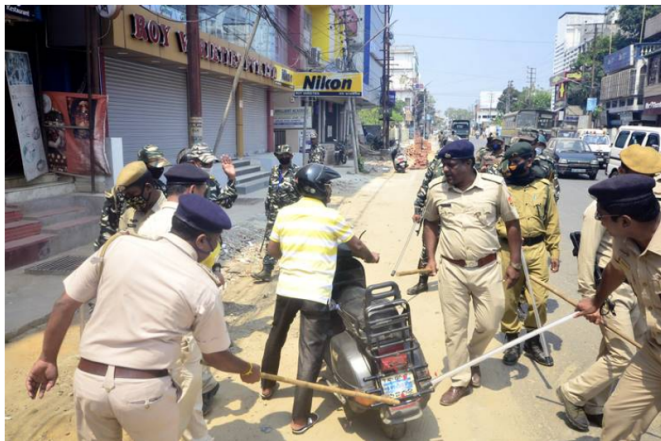
Agartala: Police personnel (L) beat a scooterist with batons as they enforce complete lockdown for containing the spread of the novel coronavirus, in Agartala, March 25, 2020.

On the second day of lockdown for coronavirus in Tripura, the state police and other law enforcement agencies applied force to enforce lockdown curfew as violators were seen loitering in Agartala and other parts of the state.