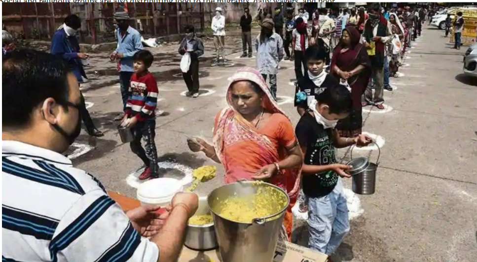
Homeless persons and stranded migrant workers queue up to receive food in designated spots maintaining social distancing at Ramakrishna Ashram, New Delhi on Friday, March 27, 2020.

The Union Ministry of Home Affairs has already issued an advisory to all states to make arrangements for the stranded workers. Social and religious groups are also distributing food to the migrants, daily wagers, and poor.