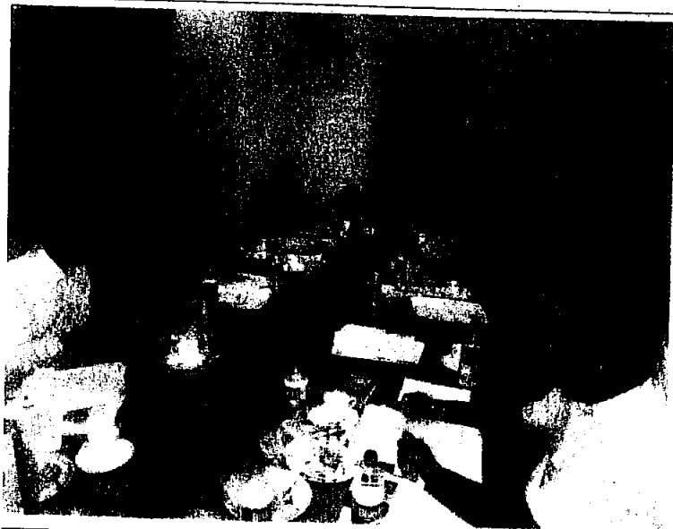
Photographs of 2 nd meeting of the Working Group held at CPCB, New Delhi