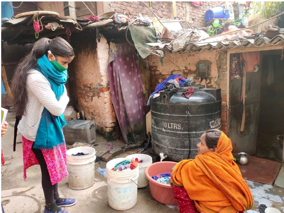
Protsahan Social Worker interacting with the community members in Dwarka slums

T he situation of slum dwellers is extremely vulnerable during the COVID-19 pandemic. While the “privileged” urban population can afford to ensure physical distancing, hygiene, access to essentials and non-essentials, work from home, and get covered under social safety measures, the urban poor are struggling to survive and make ends meet. But though they are the victims, they are often blamed for spreading the disease, and become targets of stigma, isolation and discrimination even from their employers. Protsahan has been in continuous conversation with the girls, their parents and the community members to understand the impact of second wave of the Covid-19 on their lives, livelihoods and children. Following is a quick pulse check documentation of ground updates.